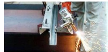
Straight guide rail 500 mm