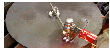
Large circle attachment